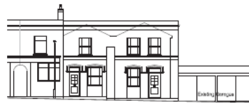
ELEVATIONAL DETAIL AS PROPOSED