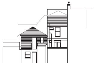
REAR SECTIONAL ELEVATION AS EXISTING