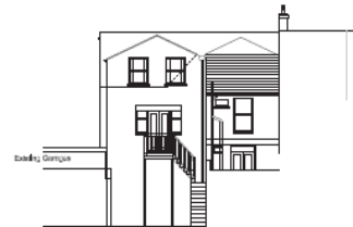
ELEVATIONAL DETAIL AS PROPOSED

Coming to auction in July is this garage and stores with planning permission for demolition of garage and stores to make way for a new two bedroom townhouse. Planning permission granted under P/00303/10 with full details available on application.